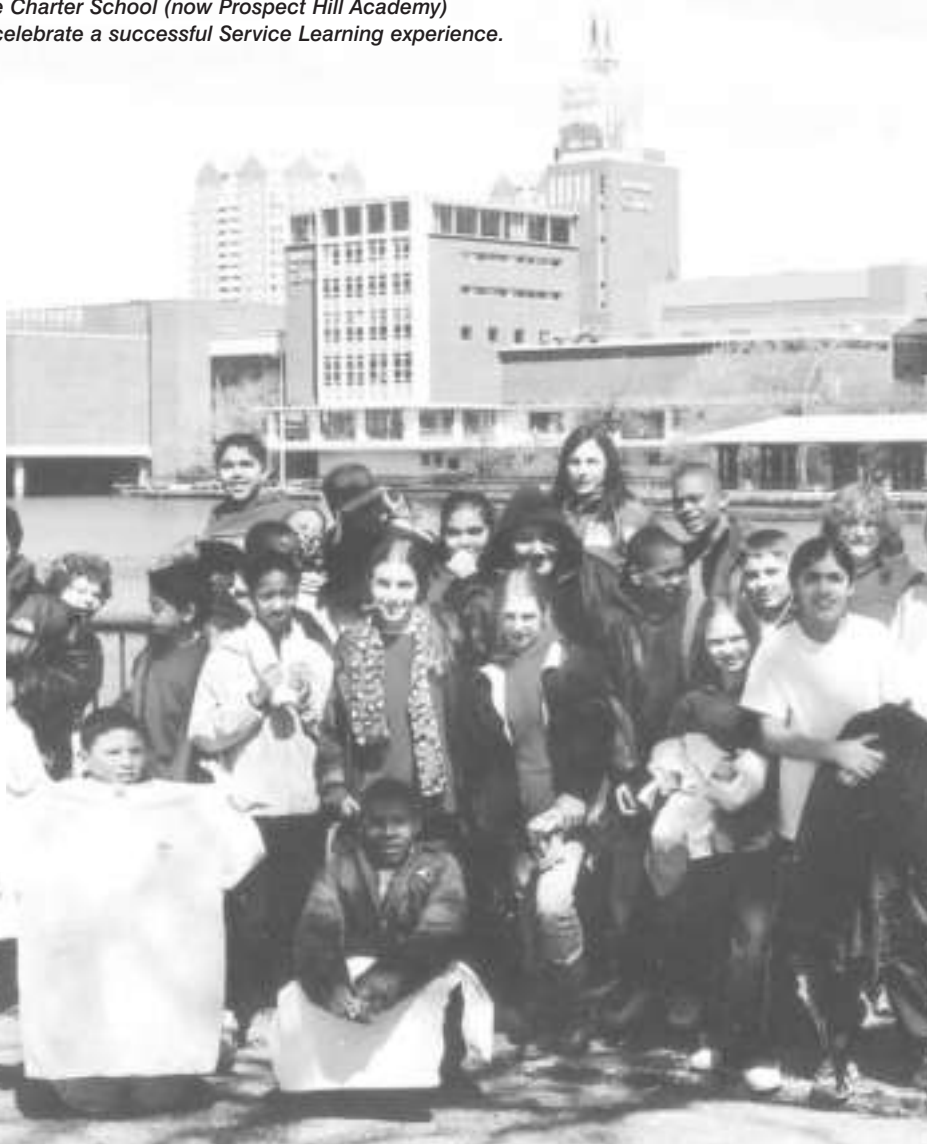
Somerville Charter School (now Prospect Hill Academy) students celebrate a successful Service Learning experience.