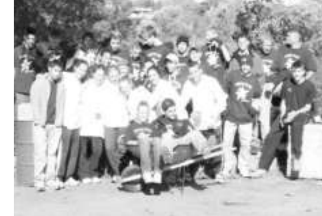
Newton North athletes in Herter Park West.